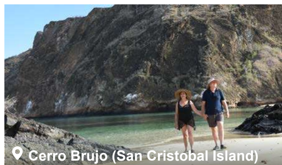
Cerro Brujo (San Cristobal Island)

From our dinghy ride, as we head to shore, we are first humbled by the immensity of the stunning cliffs of the Sorcerer's Hill. You can enjoy simply sharing the beach with sea lions, snorkelling from shore, or taking a walk to a hidden lagoon where you might spot black-necked stilts, ruddy turnstones, whimbrels, and white-cheeked pintails.