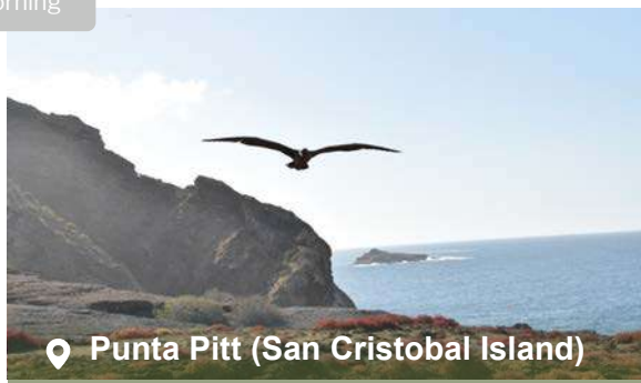
Punta Pitt (San Cristobal Island)

This is the only place on the islands where we will enjoy the chance to see all three of the booby species in the same place. The red-foots will be perched on the Cordia lutea and small trees, the Nazca's on the ground near the cliff edge while the blue-foots will be a little further inland. Frigatebirds will be all around and the views are breathtaking.